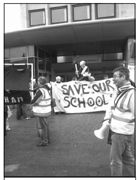
Oldham demonstration against academy schools

Councils across Greater Manchester want to close working class schools and re-open them as Academies. They already exist in Manchester and Salford, now Tameside and Oldham want to get in on the act.